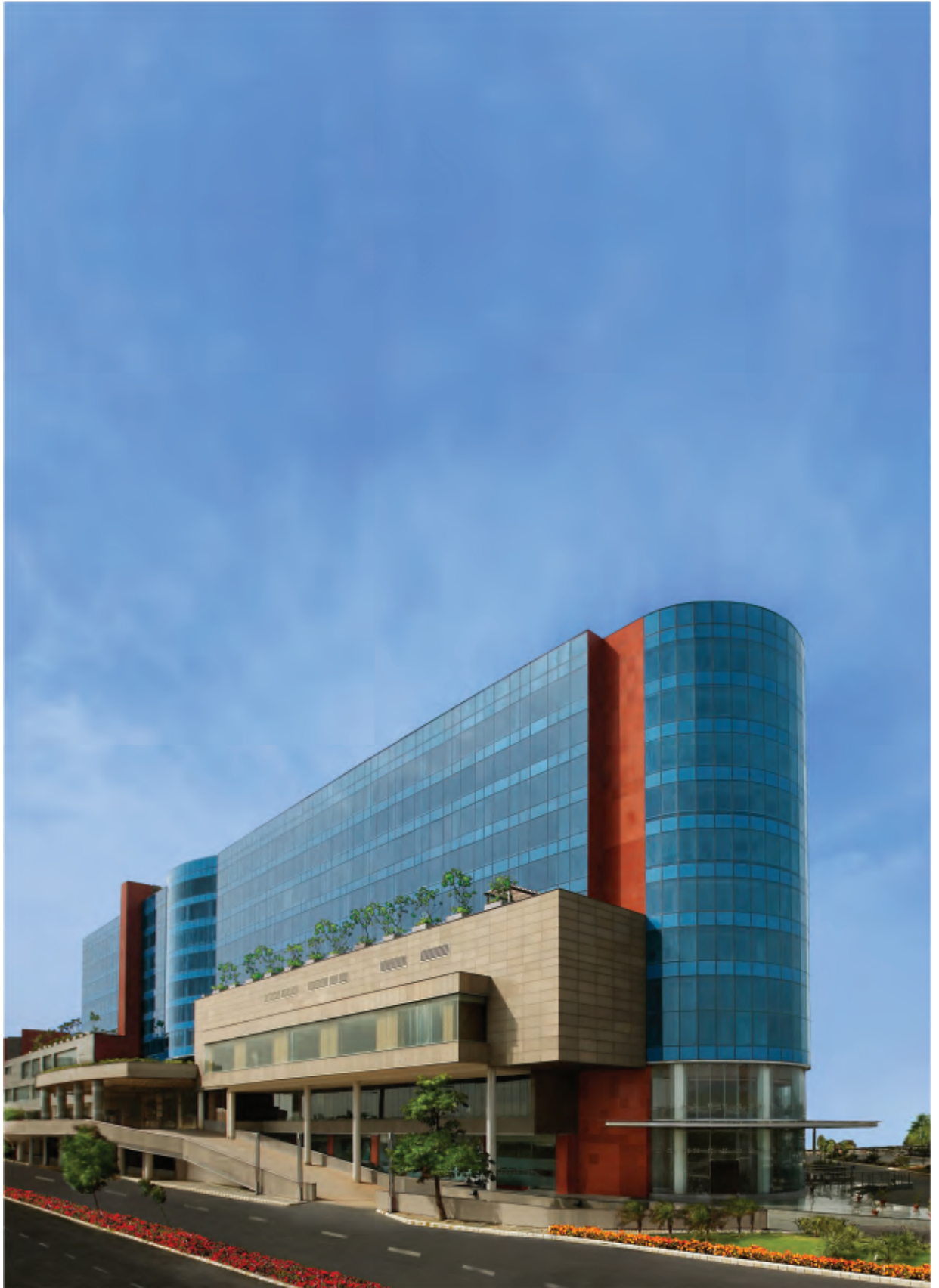
The Leela Kempinski Gurgaon