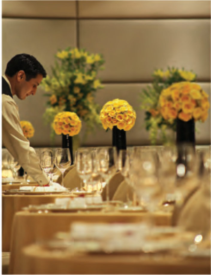
The Royal Room